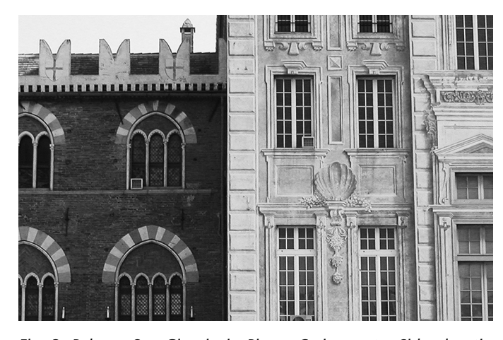
Fig. 3. Palazzo San Giorgio in Piazza Caricamento. Side elevation with Renaissance frescoes and restored medieval portion.

The (French) Revolution brought to its highest intensity the idea of the public, and established... an ultimate antagonism between the unshadowed manifestness of the public life and the troubled ambiguity of the personal life, the darkness of man's unknowable heart. What was private and unknown might be presumed to be subversive of the public good. From this presumption grew the preoccupation with sincerity, with the necessity of expressing and guaranteeing it to the public-sincerity required a rhetoric of avowal, the demonstration of single-minded innocence through attitude and posture.12