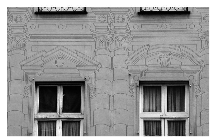
Fig. 6. Palazzo in Piazza Zecca. Facade restored with painted

SCALE: One of the greatest magic leaps of architecture and of drawing is that of scale, establishing a relationship between the presumed subject and the relative size of its representation on paper, wall, or in building. One can describe an atom or the universe on a sheet of paper, and an architectural drawing may range in scope from a building detail to a site plan or the map of a city, but we are habituated to reading these relationships effortlessly, picking up the clues to project ourselves into this artifice, unconsciously suspending disbelief. If Palladio and Scamozzi set a theatre as a city, then the pittori of Genoa transformed the city into a theatre. The offering of the painted facade is first at the 1:1 scale that lets the thing represent itself in Borge's game of "life-size", followed by the sub-games of monumental and minuscule within its surface, and extending outward to enfold the city. Size, after all, does not matter, except to augment the expressive relativity of scale to foster the imaginative agility to make extraordinary mental leaps.