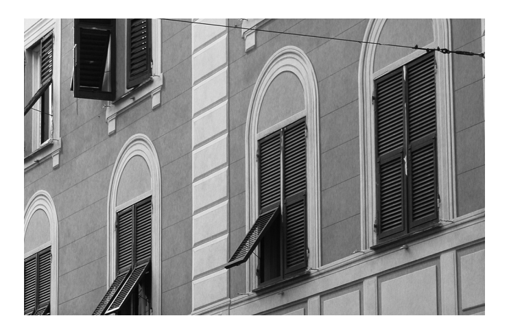
Fig. 5. Apartment building, Via Pertinace, 6. Newly painted 2002-3. Detail.

variety of ways, including Alberti's "drawn" architecture of the Palazzo Rucellai, the play of depth that Palladio could exercise in only few inches of stucco, and the taut surface of Kahn's Yale Center for British Art. To contradict the literal transparency of a simplistic version of modernism, Colin Rowe and Robert Slutzky introduced the concept of phenomenal transparency to address modern ideas of "space" and composition suggested by Cubist painting, using such conditions as "'transparency', 'space-time', 'simultaneity', 'interpenetration', 'superimposition', 'ambivalence'". 13 Bernard Hoesli elaborated some of these lessons<sup>14</sup> to discuss the complex facade compositions of the Ca d'Oro, Michelangelo's design for San Lorenzo, and the work of Le Corbusier. If Robert Venturi emphasized the role of the facade in an architecture of sign over space, we have the further post-modern treatments of the glass curtain wall as an ambiguous facade, providing translucent enclosure that bears other signs as well, as in the work of Jean Nouvel or Herzog and deMeuron.