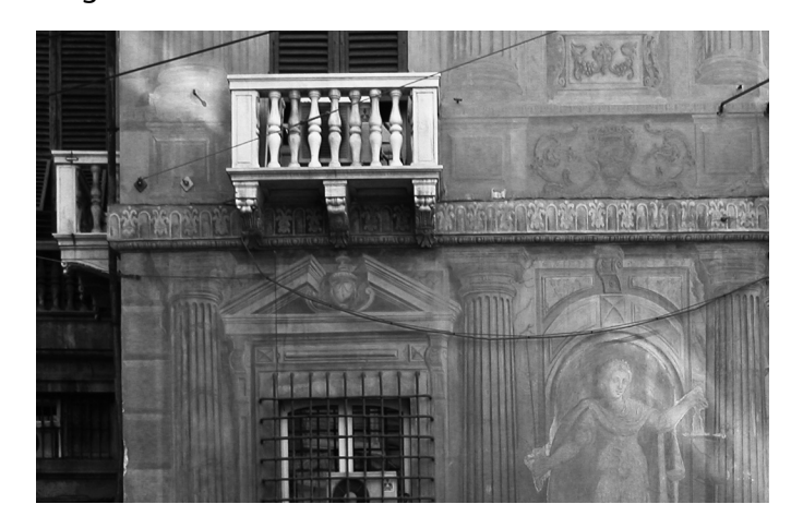
Fig. 1. Palazzo Interiano-Pallavicino, Piazza Fontana Marose. Detail.

construction of a clear line of reasoning, but a construction of relationships and references that may foster insight.