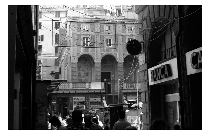
Fig. 2. Painted facade of the church of San Pietro, Piazza Banchi.