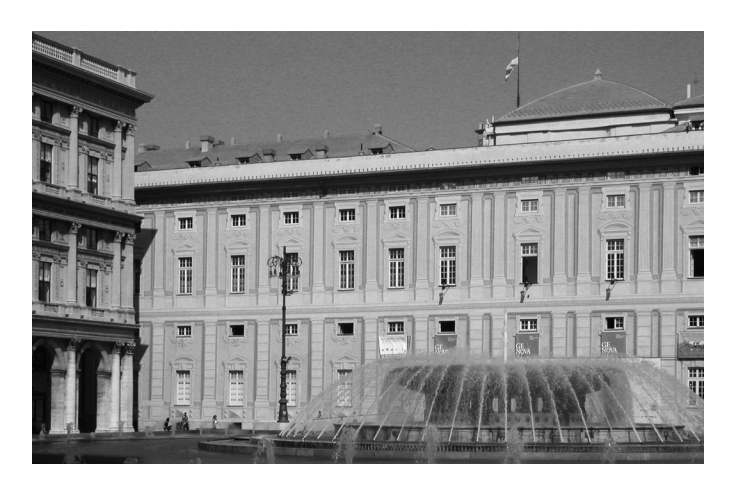
Fig. 4. Palazzo Ducale. Nineteenth century painted elevation facing Piazza de Ferrari and the modern city.