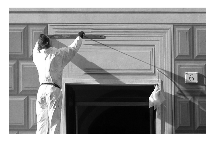
Fig. 8. Decoratore Massimo Pozzoni at work on Via Pertinace, 6.

thoughts and imaginings, our knowledge and beliefs, return to and spring from what we say and do, what we build or put to paper, the marks that we make on a surface.